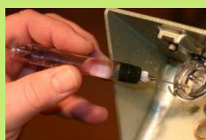
Easy Access "L" size bobbin