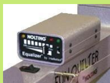
Dual Sided Stitch Regulator