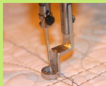
Round Foot for ruler guides